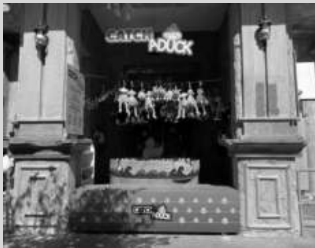
CATCH A DUCK