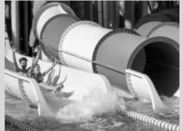
ABYSS | RAFTING RAPIDS | STARSHIP | SEA VOYAGER