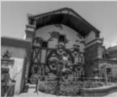
ROUND THE WORLD