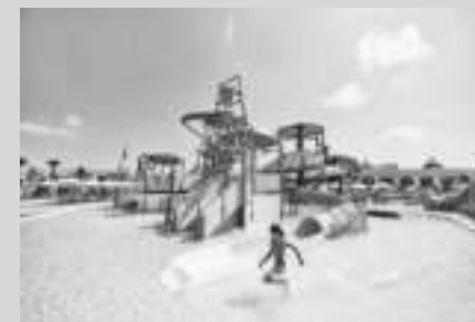
AQUATUBE 1 | AQUA TUBE 2 | UPSIDE DOWN | MULTI SLIDE