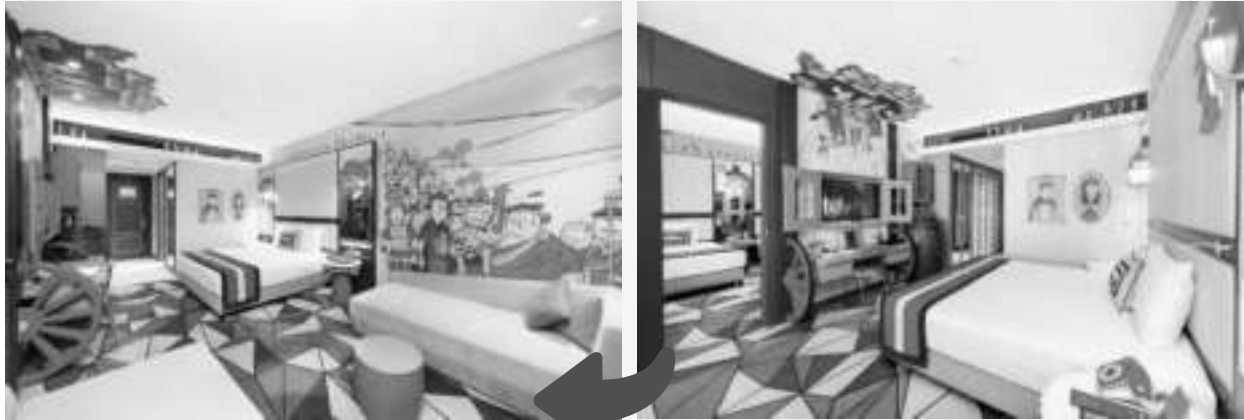
DELUXE CONNECTED ROOMS