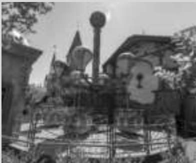
AIR BALLOON RACE