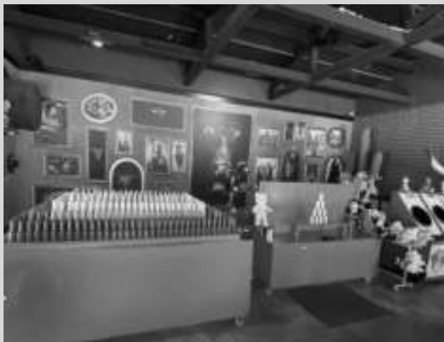
RING TOSS BEAR'S FRUIT TOSS CAN SMASH